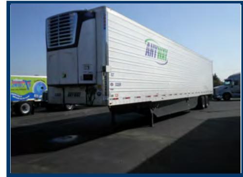
GROUP OF 2016 UTILITY REEFERS Carrier Reefer Units, 53 x 102, air ride, sliding tandems, swing doors