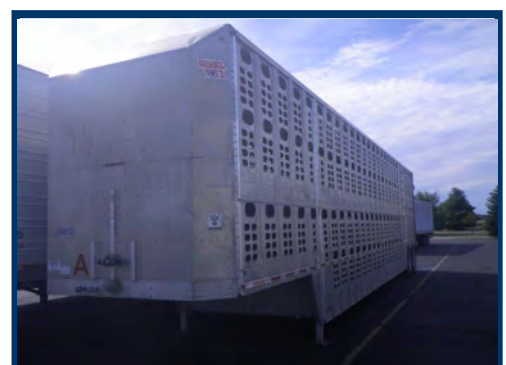
2012 WILSON 53' X 102" LIVESTOCK TRAILER Double decker, tandem ramp, air suspension