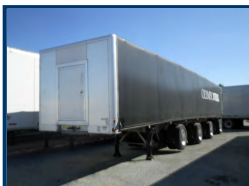
2011 REITNOUER CURTAINSIDE 48' x 102", 2 airlift pusher axles, air ride suspension, all aluminum outside wheels