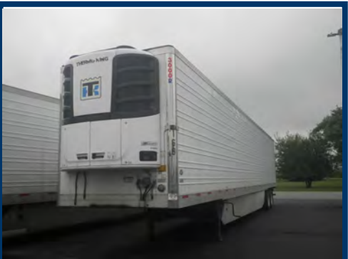
PAIR OF 2017 UTILITY REEFERS 53' x 102", Thermo King units, air ride suspension, slide tandems, swing doors. **Low Hours**