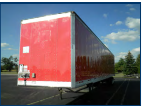
2011 GREAT DANE DRY VAN 53' x 102", air ride suspension, sliding tandems, swing door, steel wheels