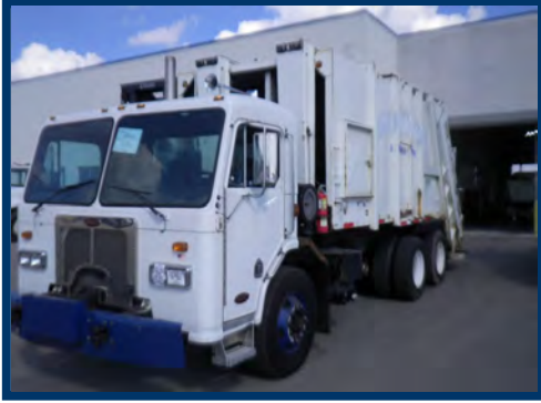
2004 PETERBILT 320 Cat w/ Allison automatic transmission, 21ft garbage bed, 18,000# fronts, 44,000# rears, P.T.O, cruise control, A/C, air brakes, 170" WB