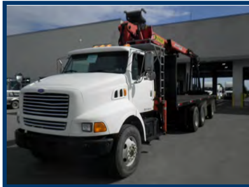
1997 FORD LOUISVILLE Cat, 8LL transmission, 25ft flatbed w/palfinger forkcrane, air lift tag axel, 2 outriggers, P.T.O., 14,600# fronts, 40,000# rears, power steering, A/C, wet kit, 208" WB